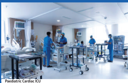
Paediatric Cardiac ICU