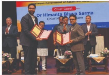
The agreement exchange ceremony.

Of the total land area, 1.46 acres will be used for the hospital, which will be developed by Ambuja Neotia Healthcare Venture Limited