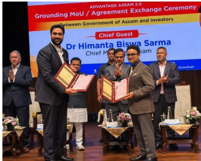
Ambuja Neotia Group to Develop ₹700+ Crore Integrated Healthcare and Hospitality Project in Guwahati

-Mixed-use development to include a 300-bed multi-speciality hospital and a 200+ key premium hotel, reinforcing Assam's role as the gateway to healthcare and tourism in the North-East-